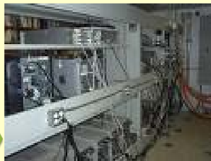
After Audit is Carried Out